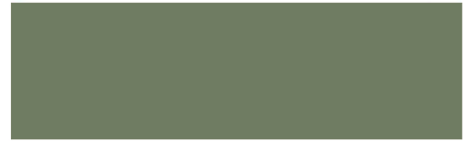
COLONY GREEN (GR) - SMP - 26 ga only