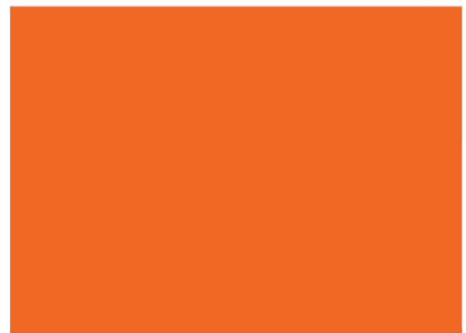
ORANGE (OR) - Fluoropon - 26 ga only

*Please see www.DeanSteelBuildings.com for the latest information on camo finish, availability by panel profile, and warranty information.