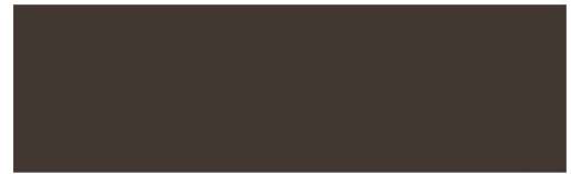
BURNISHED BRONZE (BR) - SMP - 26 ga only